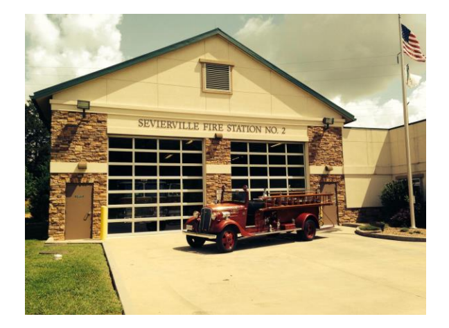
For More Information Contact

Sevierville Fire Department 122 Prince St Sevierville, TN 37862 (865)453-9276