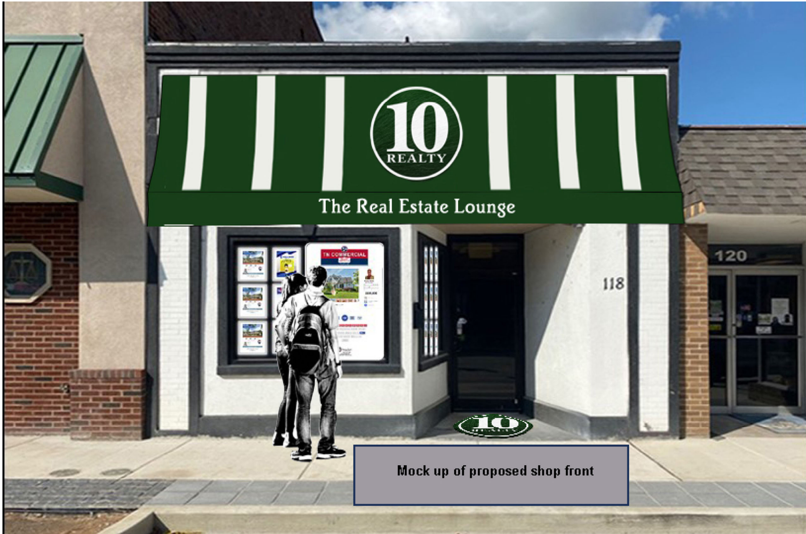
Mock up of proposed shop front