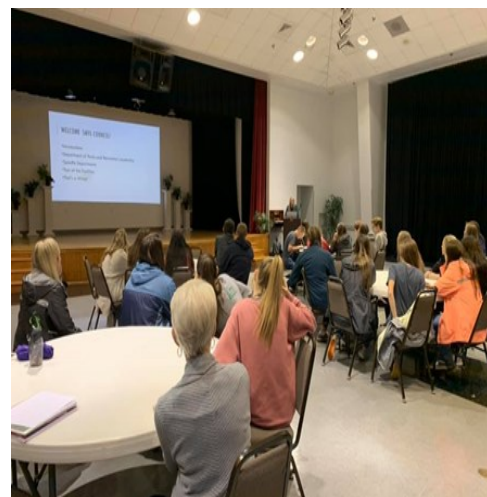
SMYL Group at Civic Center