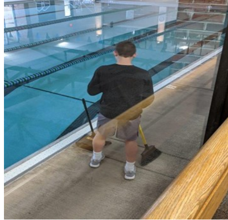
Part time Lifeguards Clean Natatorium