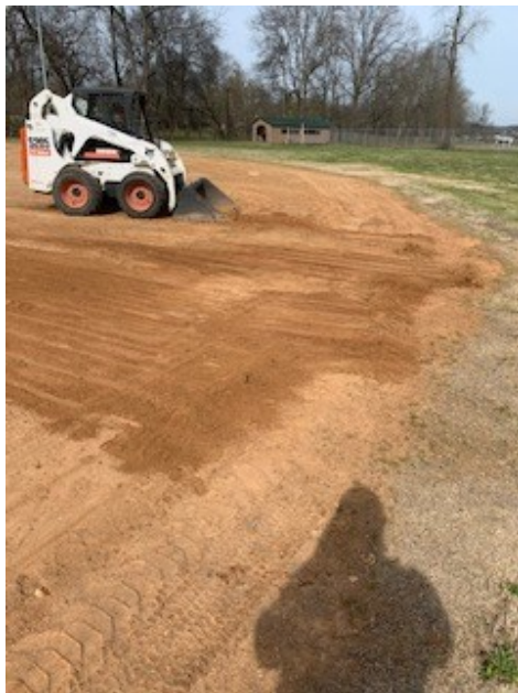
Bobcat work on field 3.