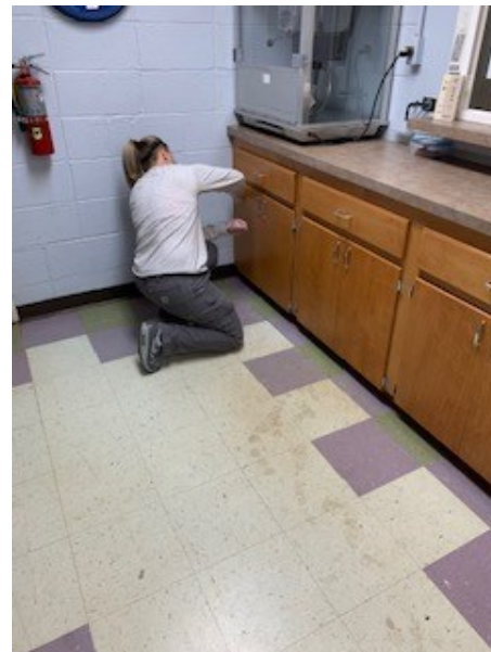
Deep cleaning of concession stand.