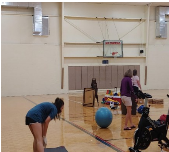
Full and Part time Staff clean the Building