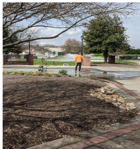
Numerous Employees Pressure Washed