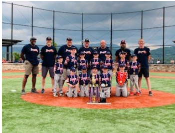
Coach Pitch Champions – Braves