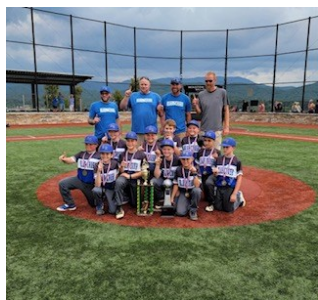
Minors Champions – Blue Crush