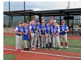
Majors Runners-up - Hammerheads