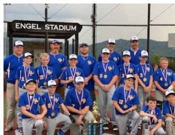
Majors Champions – Highlanders