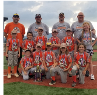
Coach Pitch Runners-up – Scrappers