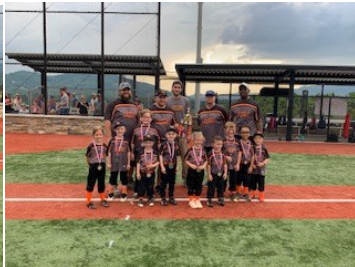
T-Ball Runners-up – Little Rascals