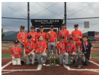
Minors Runners-up – Tigers