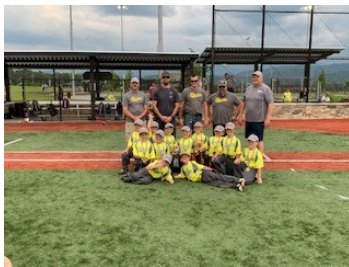
T-Ball Champions – Ducks

Pictures below are the 2021 SMYBA/PFYBL Tournament Champions and Runner Ups for each division PLAYED AT 'THE RIPKEN EXPERIENCE IN PIGEON FORGE'