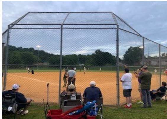
Boys Baseball Tournament June 4-6