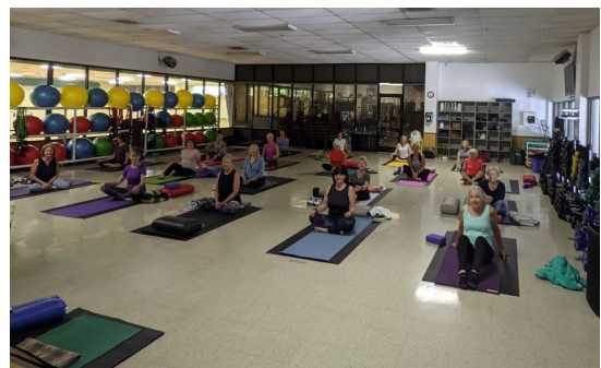
Our classes are back to full capacity

Sevierville PARKS AND RECREATION So much more than a walk in the park,