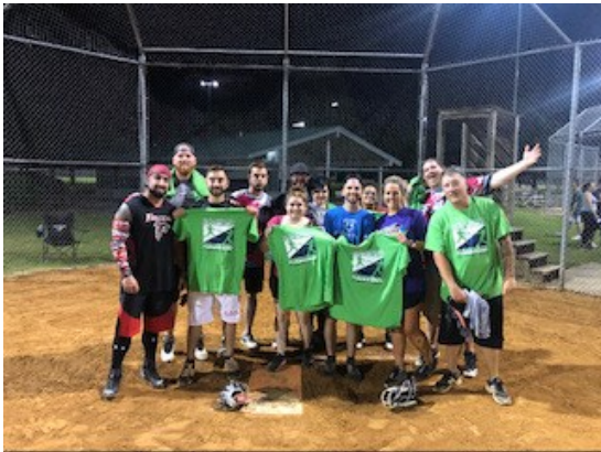
Spring 2021 Co-ed Champions—Off Again